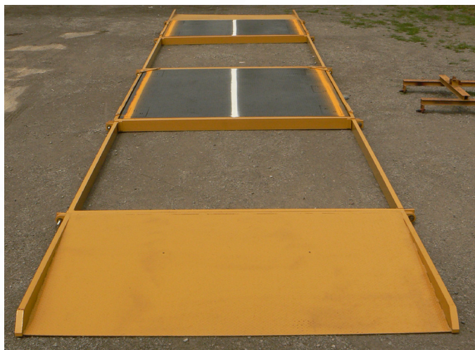
Multiple platform configurations available