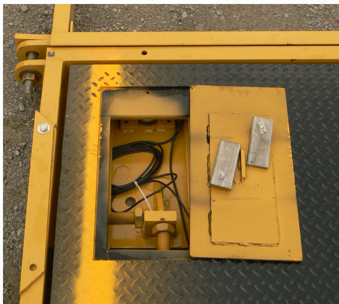
Fully serviceable from top access plates