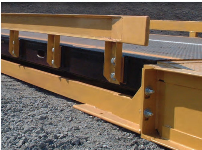
Optional side safety rails