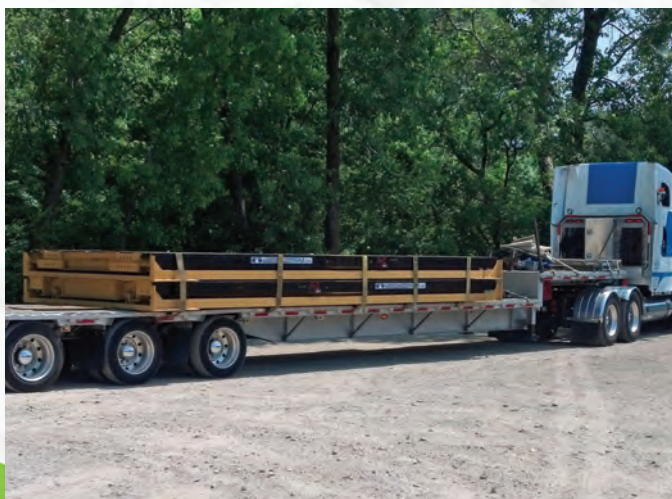
50' x 10' 100 ton capacity shipping to illinois