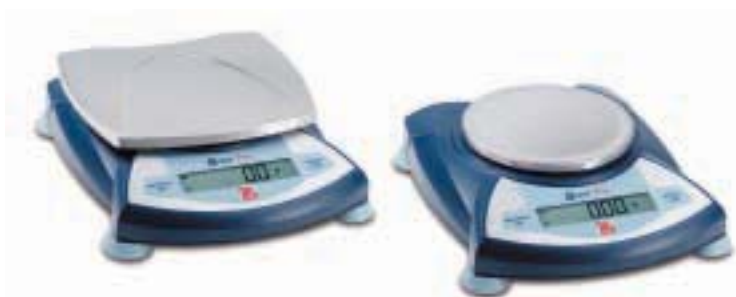
Scout Pro with Square Platform (6.5 x 5.5 in / 16.5 x 14.2 cm)

600g x 0.1g 2000g x 0.1g 4000g x 0.1g 6000g x 0.1g 6000g x 1g